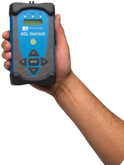
ADL Vantage Compact and Easy to Use